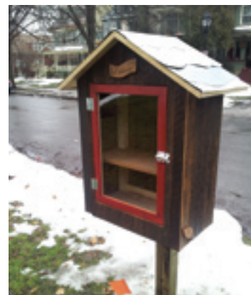
One of 10 "Little Libraries" in the Parkside Community

right of way at 10 locations throughout Parkside. Each station has been constructed