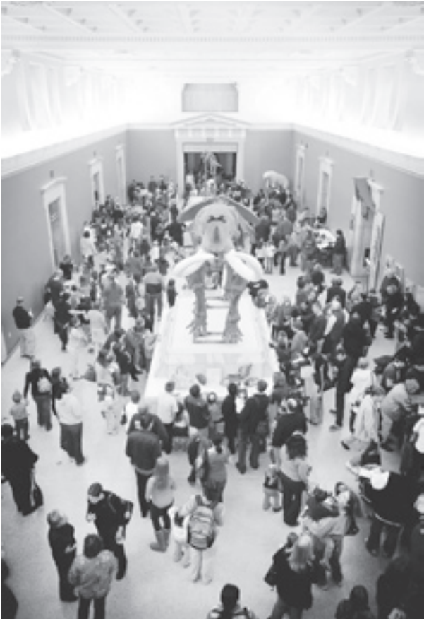
A Prehistoric Birthday Bash will take place for Seymour and Stanley at the Buffalo Museum of Science.

and other area team mascots will be in the Science of Sports exhibit for photos and friendly competition.