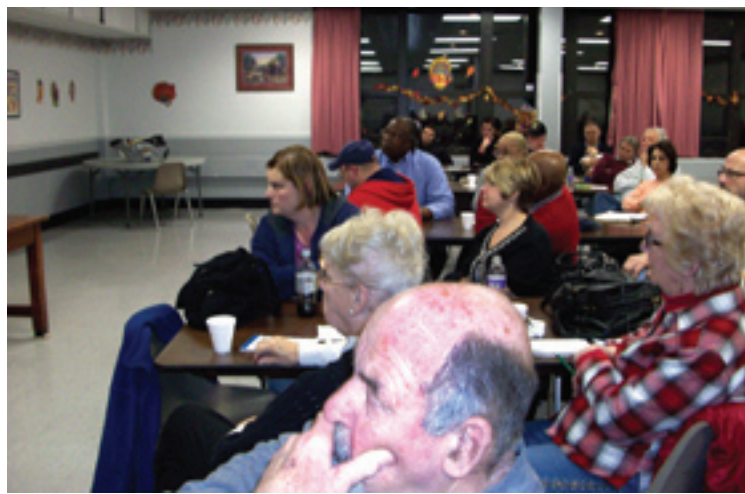
Concerns about the neighborhood were raised by local business owners and residents at a 'Town Hall' style meeting on Tuesday night.