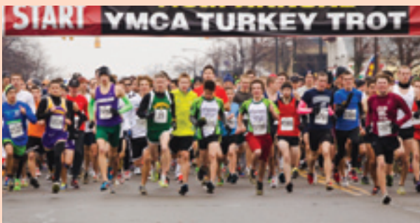
117 years and still breaking records.

tume and best group costume. Contenders should meet in front of the Delaware Family YMCA at 8:50 am on race day to go in front of a celebrity judge from