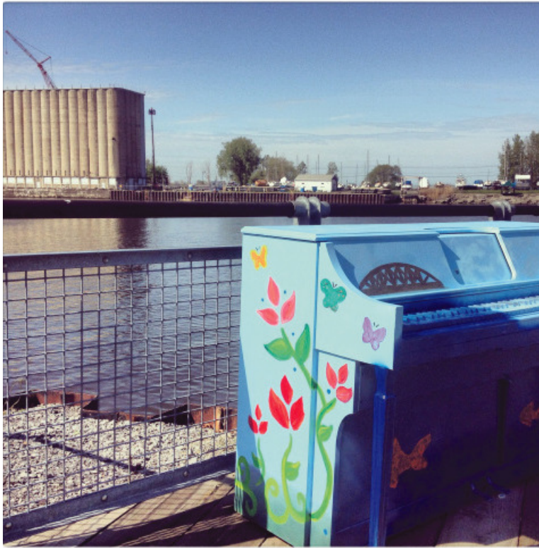
Outdoor pianos are located throughout the area.

Pianos in Public Buffalo's pianos are donated by Western New Yorkers, painted