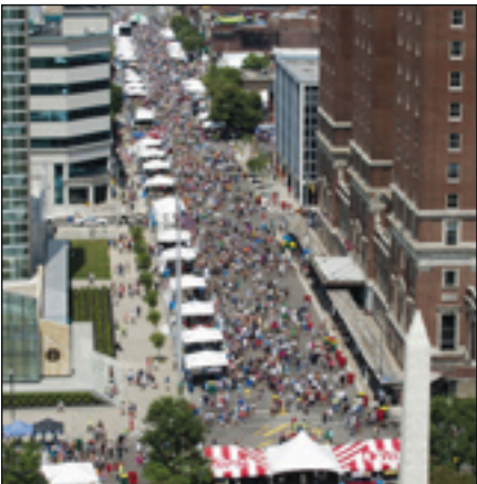
Thousands of Western New Yorkers flock to the Taste of Buffalo, the country's largest annual two-day food festival, on Delaware Avenue.

Enjoy your food at a bistro table under one of ten new William Mattar Shade Zone tents scattered throughout the festival. The new Beer Tent on Niagara East in Niagara Square will be open until 11 pm on Saturday featuring live music from Buffalo's best