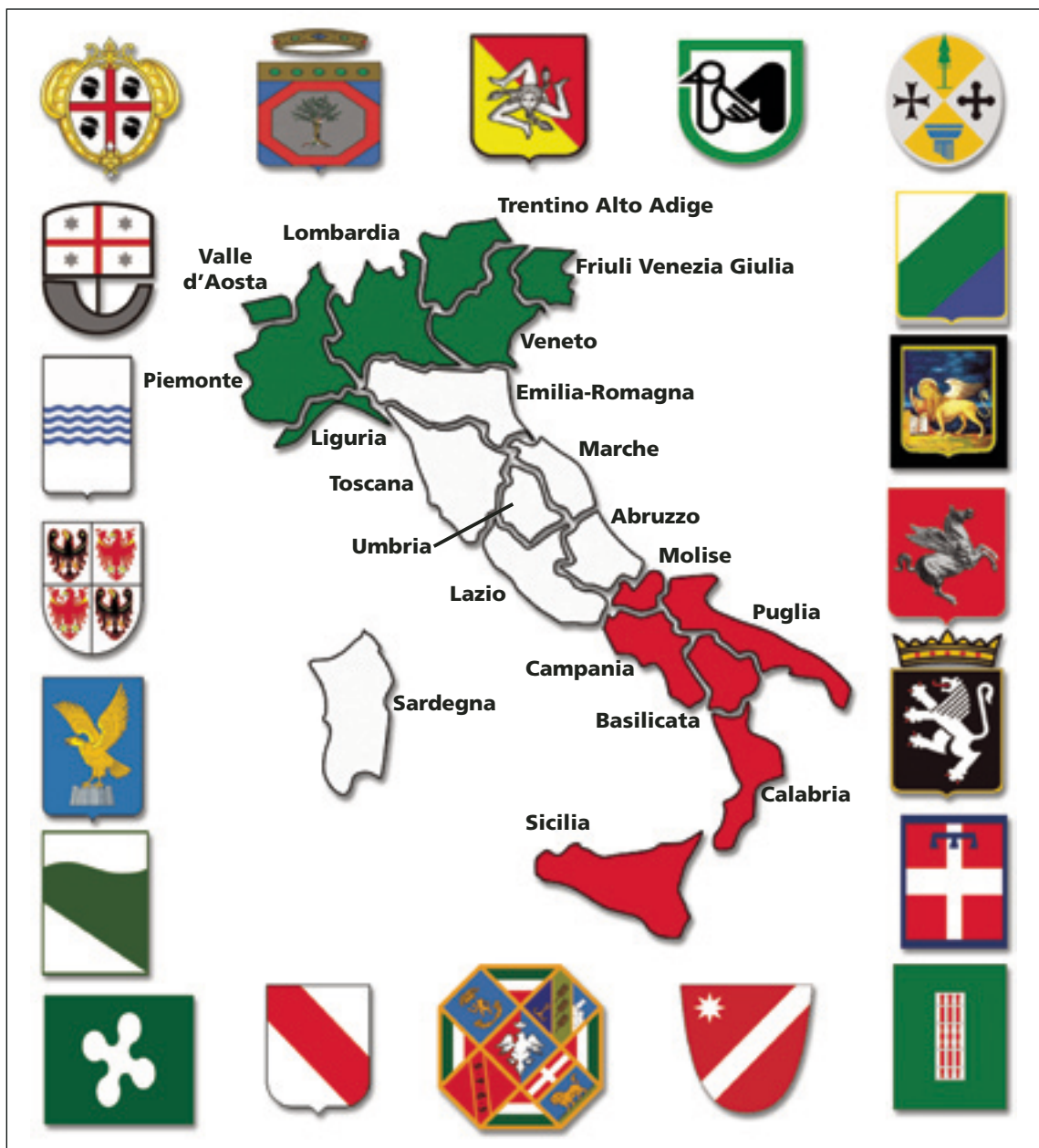
The Italian Heritage Festival celebrates the diversity of Italy's 20 regions.