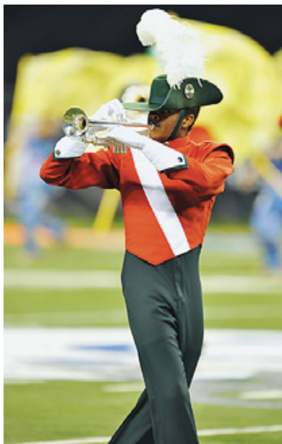
The Blue Devils of Concord, CA (left) and the Santa Clara Vanguard of Santa Clara, CA (right) will be hosted by Buffalo Schools.

The top seven drum corps in the world will begin arriving in the very early hours of Sunday, August 3rd, for the annual Drums Along the Waterfront Tour of Champions event taking place at 7 pm that evening at Robert E. Rich, Sr. All-High Stadium, located at 2885 Main Street in Buffalo.