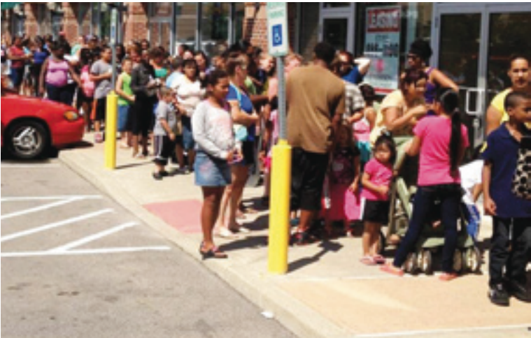
Hundreds line up outside TCC on Delaware Avenue during last year's School Rocks Backpack Giveaway.