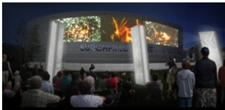
The Front Yard will open on September 12th.