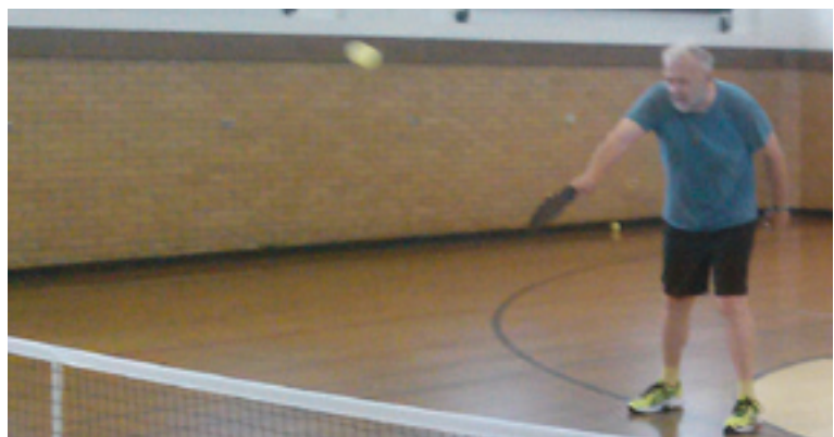
Pickle-Ball is a cross between tennis and table tennis and can be played by anyone of any age.

Pickle-Ball is being offered 9:00-11:00 am on Tuesday and Thursday mornings. Don't miss the chance to learn about one of fast growing sports in the area.