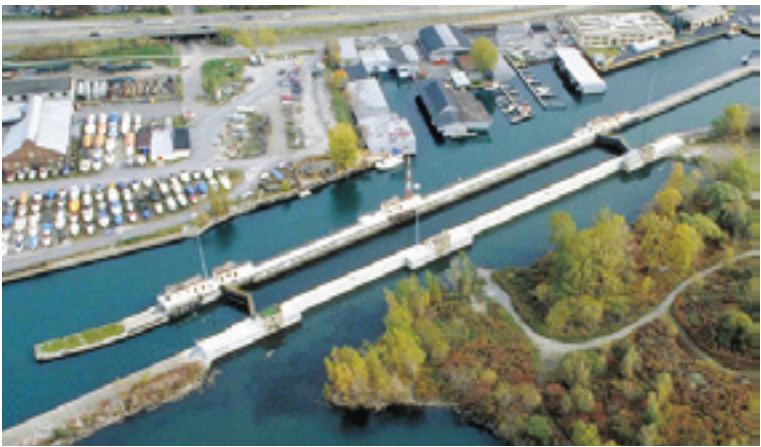
The Black Rock Lock has been in use since 1914.

The US Army Corps of Engineers Buffalo District and its community partners, the Black Rock Historical Society and Black Rock-Riverside Alliance, invite the public to attend an historic celebration of the 100th anniversary of the opening of the Black Rock Lock on Sunday, August 17th from noon to 4 pm.