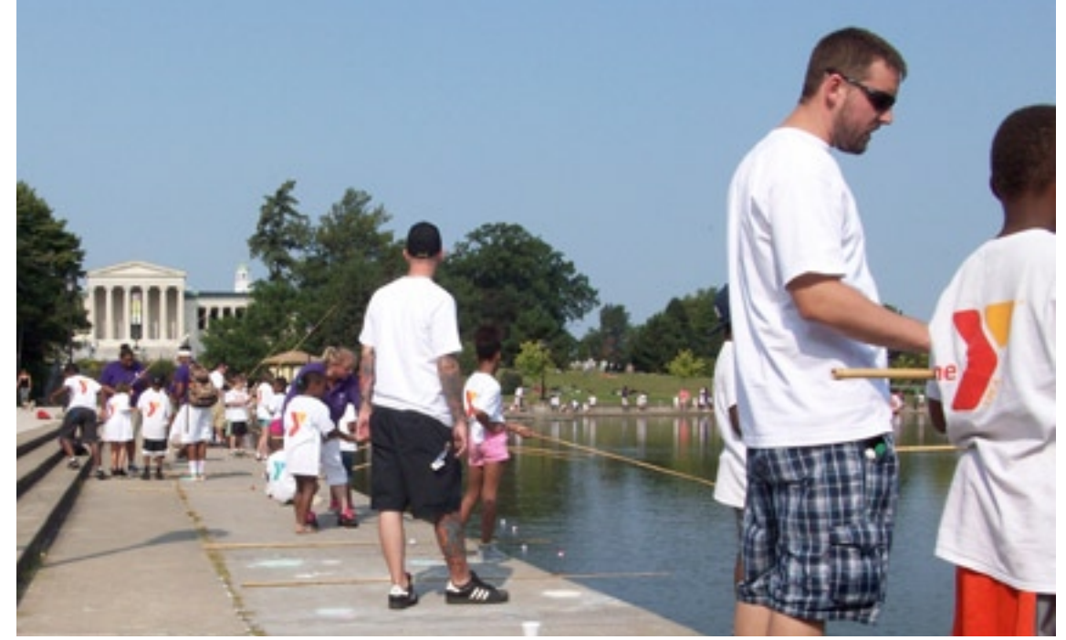
The Annnual Elmwood Kiwanis Fishing Derby was held Wednesday at Hoyt Lake in Delaware Park in conjunction with the United Way "Day of Caring" Program. 150 kids participated from the Delaware YMCA Summer Youth Program.