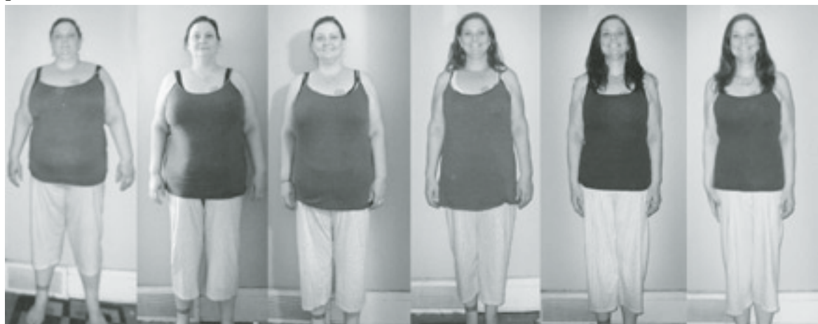
Progress: These photos were taken at 8-12 week intervals, beginning a few days before my Vertical Sleeve Gastrectomy procedure. The last photo was taken on the one-year anniversary of my surgery date.

markably different after my surgery, and in myriad ways it's far better than I'd imagined. But it has been anything but "easy," and I still have to work hard to utilize the tool. Monitoring my nutrition and fitness takes a lot of work, coordination, planning, and prioritizing, as does any weight-loss program. Weight Loss Surgery is not the "easy" way out, but it was the way that finally worked for me.