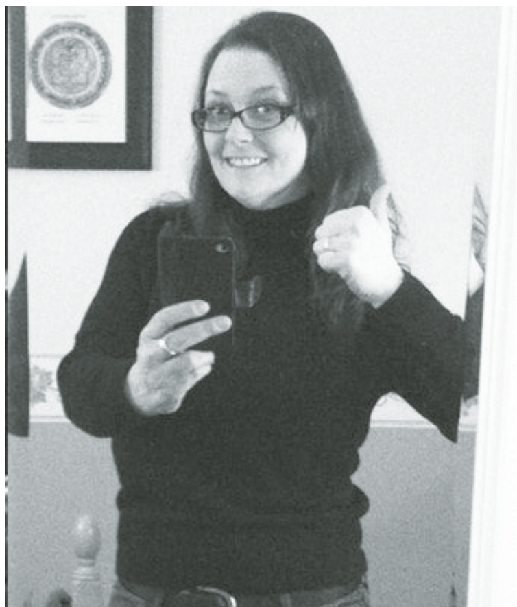
What a difference a year makes.