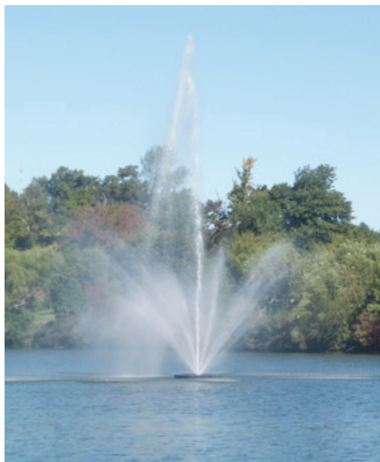
The new fountain at Hoyt Lake can be seen from the Delaware Avenue S-curves.

Located in the south east part of the lake, the water feature can be seen from the Delaware S-curves.