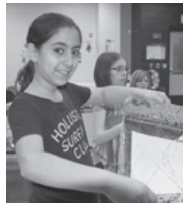
A proud artist displays her masterpiece created during Y Arts Week.

As part of a commitment to youth development, the Y works to help youth discover new skills