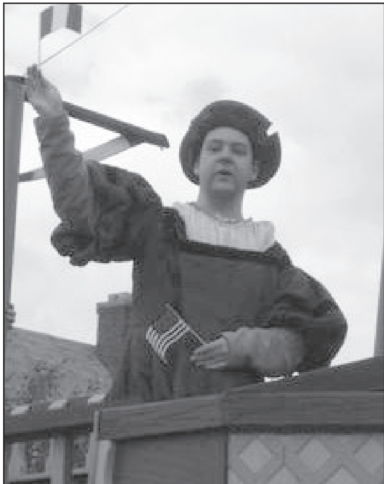
Christopher Columbus sails through Little Italy aboard a replica of one of his famous ships.

the heart of Buffalo's Little Italy, ending just after Parkside Avenue. A variety of marching units, including representatives from Federation member organizations, will participate.