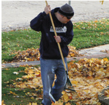
Buffalo residents are advised that raking leaves into the street is illegal.

The City of Buffalo will collect bagged leaves and yard waste from now until December 1st. City residents can put their bagged leaves at the curb during this time period for composting. To participate in this collection, city residents are asked to place their leaves in clear plastic bags or brown recyclable bags. These bags are available at local hardware stores, home centers, and other retailers. There is no limit