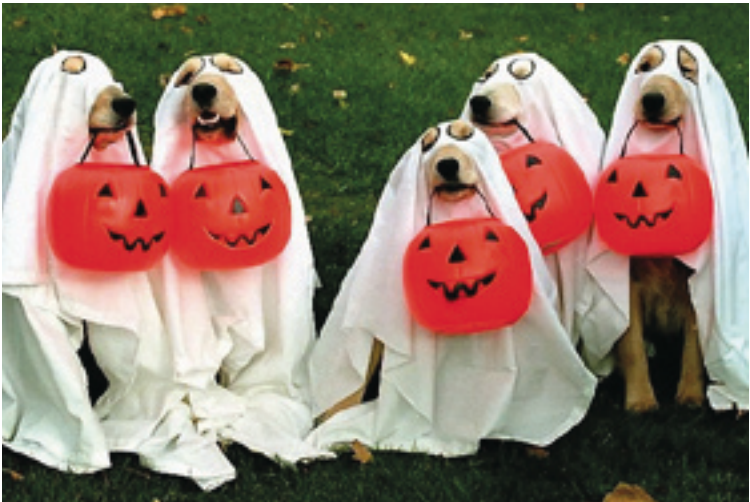
Ensure a happy and healthy Halloween for your furry friends by following a few simple safety tips.

Hungry pets: Chocolate can be fatal to your pet! The sweet smell of Halloween chocolate and other candy left by a door pleases pets, as do cookies and cakes served at Halloween parties. Sweets can Continued on page 10