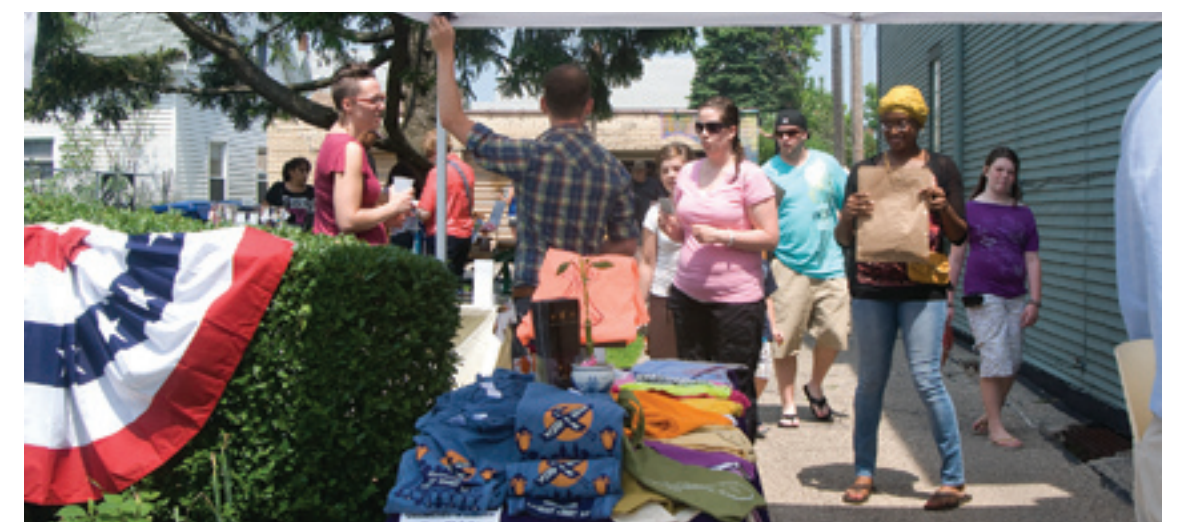
Discover Amherst Street XV Festival. Saturday, June 16th from 10 AM to 5 PM in Amherst Street between Elmwood Avenue and Military Road.

Do you want to check out Buffalo's top up and coming neighborhood? Are you interested in a family friendly and free event? Do you like parades, pie, strawberry shortcake, local art and music, War of 1812 & Black Rock history? If you answered yes to any of these questions then attend Dis-