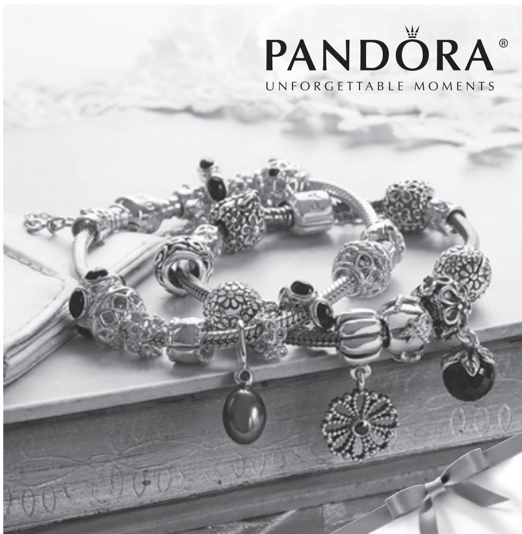
Sterling silver charms from $25

FREE DELIVERY! Call 874-1876 2941 Delaware Ave., Kenmore