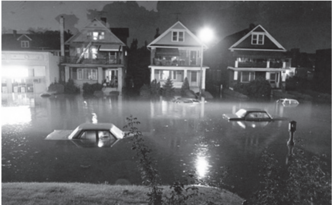
Past flooding on Hertel Ave. caused major damage to homes and businesses.

fixed and the problem that was, is no longer there. The whole street has been torn up and redone to accommodate the water that runs down Hertel from Main St. to this low spot on the avenue. This is the spot where the water was the deepest. That did not mean that other areas were not affected. All the basements were flooded right to the ceilings. The damage was enormous and the after effects were felt for months. All those hundreds of busi-