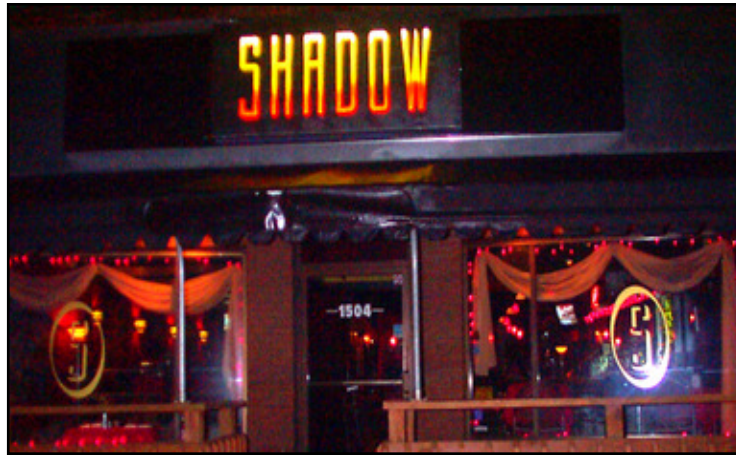
Shadow Lounge and Restaurant is located at 1504 Hertel Ave.