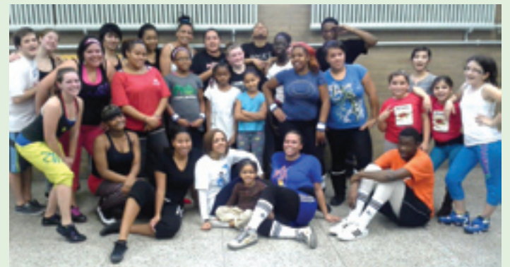
The Black Rock/Assumption Boys & Girls Club hosted a two hour Zumbathon to kick off the "Fit Family Fridays" program.