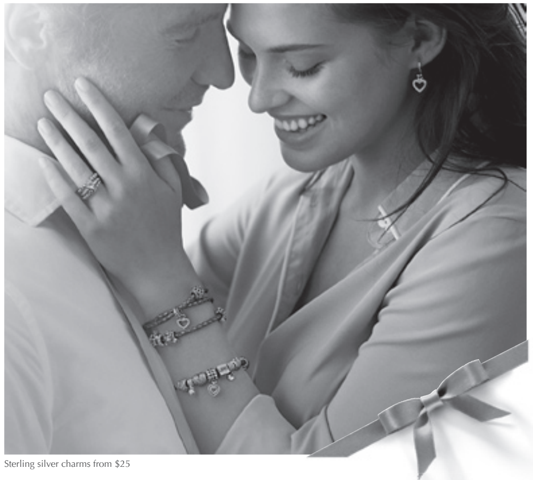
Sterling silver charms from $25