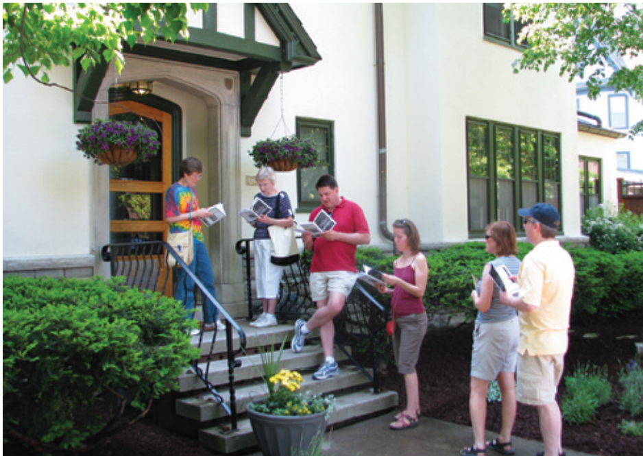
Attendees of the Parkside Tour of Homes consult their tour books while visiting 156 Jewett Parkway.

The Parkside Community Association presents the 15th Annual Tour of Homes on Sunday, May 19th from 11:00 am – 4:30 pm. This popular tour will have eight outstanding homes for you to explore. Visitors are promised an intriguing look inside residences in Buffalo's Historic District of Parkside. Some of the homes reflect their 19th century origin in architectural style with their interiors and furnishings. Others offer an exciting contemporary approach to city living. Onsite docents will provide