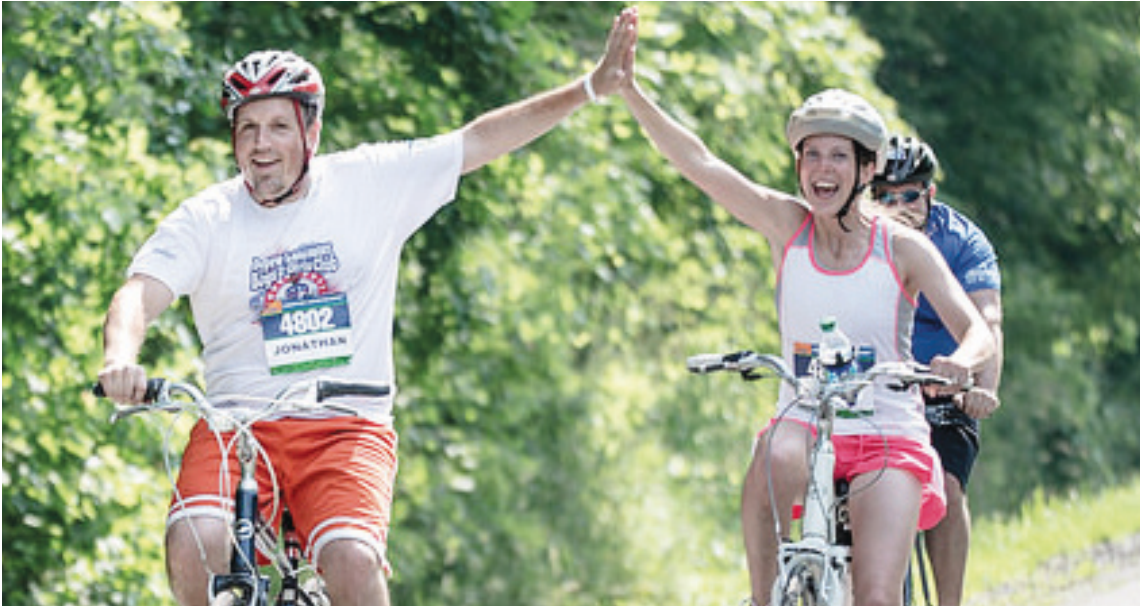
This year marks the 20th anniversary of the Ride for Roswell, which has several route options and is open to cyclists of all abilities with all types of bikes.

The 20th Anniversary Ride for Roswell will take place on Saturday, June 27th. The weekend will kick off on Friday, June 26th with the inspirational and emotional Celebration of Hope, a rally against cancer and a celebration of survivors, patients, and the Roswell Park heroes fighting for a cure. The event is free and open to the public. The next morning is