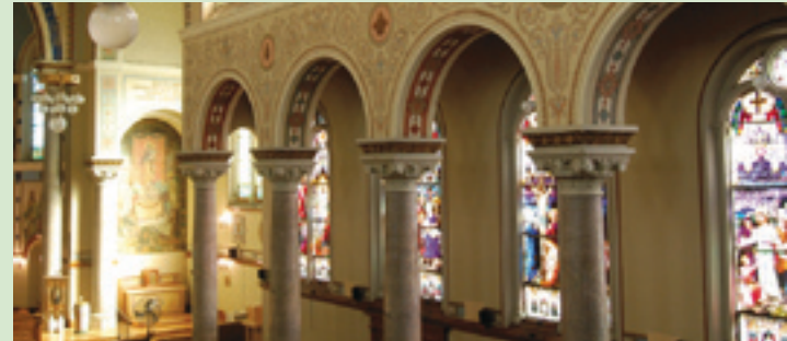
The Buffalo Religious Arts Center is one of the landmarks in the Sacred Sites Open House Weekend.

tours on Saturday, May 16th from 11 am to 3 pm. Call 481-2350 or visit buffaloreligiousarts.org . Westminster Presbyterian Church, 724 Delaware Ave., will offer free tours on Sunday, May 17th from noon to 2 pm. Call 884-9437 or visit wpcbuffalo.org .