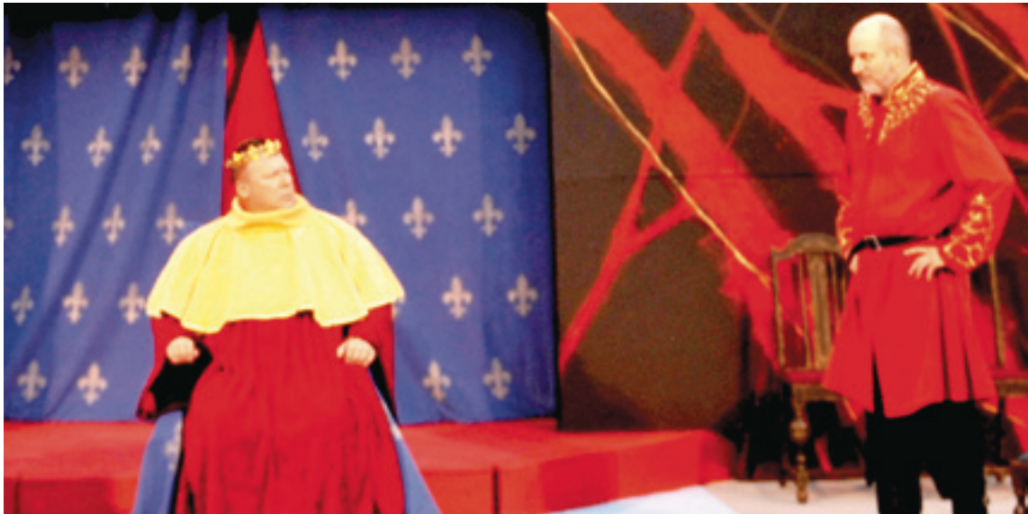
Shakespeare in Delaware Park has been entertaining and delighting audiences for 40 seasons in one of the largest free outdoor Shakespeare festivals in the U.S.

Shakespeare in Delaware Park is pleased to announce its 40th anniversary season of free professional outdoor theater. This summer’s amazing season will begin June 18th when audience favorite Romeo