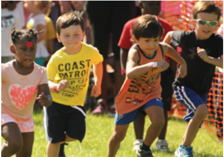
Kids of all ages are welcome to participate in the Independent Health Foundation’s Annual Kids Run.

the top three boys and girls in a variety of age categories and each participant receives a medal at the finish line, while supplies last. After the race, all participants can enjoy the Buffalo Zoo with $2 per person admission for all participants who complete the race. Limited, free parking is also available at the Buffalo Zoo parking lot and surrounding streets. “We’re excited to hold our 27th Kids Run, which Continued on page 5