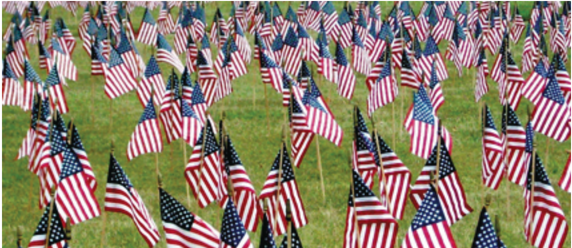
Nearly 3,000 American flags have been placed on the lawn of the Clement Mansion (Red Cross Headquarters) at 786 Delaware Avenue in the annual tribute to each individual life lost in the September 11th, 2001 attacks.

The Western New York Families of September 11th, in partnership with the American Red Cross, are honoring the memory of the lives lost in the September 11th, 2001 attacks with their annual flag tribute on the front lawn of the Clement Mansion. The families set up the