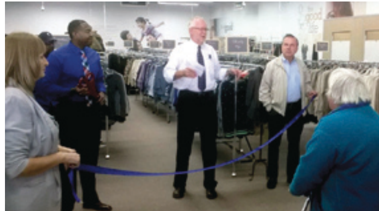
Many local dignitaries were on hand for the ribbon cutting ceremony at the new Goodwill store at 2625 Delaware Avenue in the Delaware Place Plaza.

ness" provided by Fowler's Chocolate and McCullagh Coffee were handed out and products from both companies are available for purchase in the store.