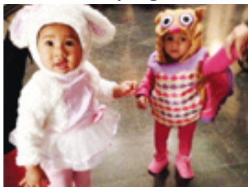
Kids show off their costumes in the parade.