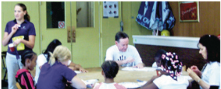
More than 3,300 Volunteers helped out at local Non-Profits during the 2016 United Way Day of Caring. Volunteers from Erie County Industrial Development Agency paired with Big Brothers Big Sisters of Erie County to serve as a "Big for a Day."

The United Way Day of Caring is the largest one-day volunteer event in Western New York. It promotes the spirit and value of volunteerism and demonstrates the power of Living United. The Day of Caring generates positive community relationships and helps to develop contacts between volunteers, agencies, and workplaces