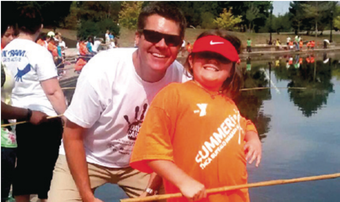
The 19th annual Elmwood Kiwanis Fishing derby was held Wednesday at Hoyt Lake in Delaware Park. Volunteers from United Way Day of Caring 2016 assisted with over 100 campers from the Delaware YMCA for this year's event.

The Elmwood Kiwanis Club of Buffalo offers an annual opportunity for the Delaware Family YMCA day camp participants to experience fishing at Delaware Park. This year's event is made possible by a large group of volunteers from Ingram Micro, Medaille College