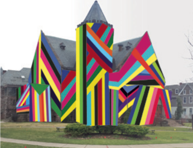
Artist's rendition of the former Richmond Methodist Episcopal Church at 467 Richmond Avenue, site of the second installation of Spectral Locus.

For more information, visit www.albrightknox.org/collection/public-art .