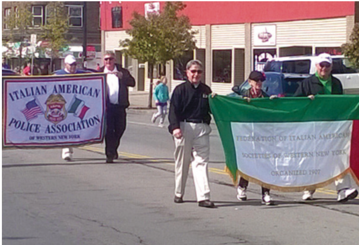
The Italian Heritage Festival and the Federation of Italian-American Societies held their 12th annual Italian Heritage Parade last Saturday, October 8th on Hertel Avenue.