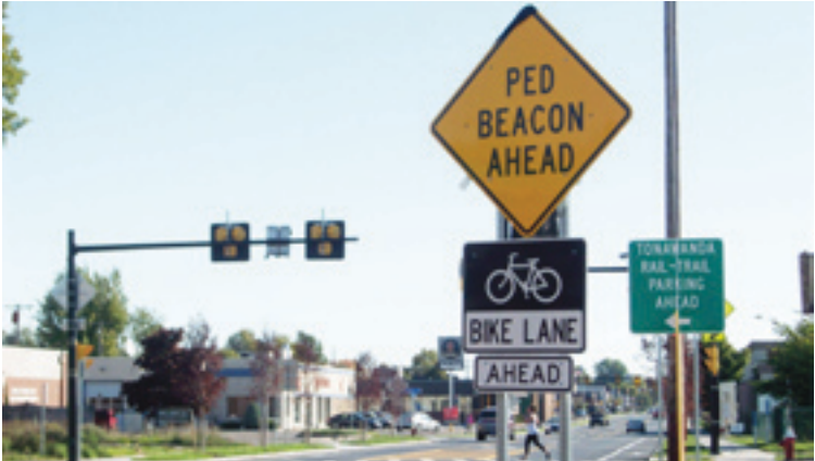
The new HAWK signal on Kenmore Avenue.

For drivers, the HAWK signal is a bit different. The HAWK signal remains unlit until a user activates the signal by requesting to cross. The signal will then begin to blink yellow, cautioning drivers to slow, followed by a steady yellow light to signal full stop. The signal will then switch to a red light. Cyclists and pedestrians will then be signaled to cross. Once the walk time for the cyclist/pedestrian ends, the light will toggle red. At this time, drivers can proceed through the signal during the toggling red light if the crosswalk is clear of people.