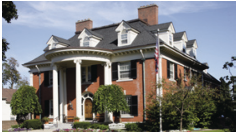
The Ronald McDonald House of Western New York is a home away from home for many families with sick children.

Ronald McDonald House Charities is celebrating its annual Day of Change and more than 40 years of keeping families close on Saturday, October