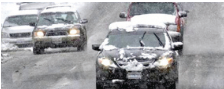
If you must drive in inclement weather, taking some basic precautions can help keep you safe.

If you have to drive, make sure everyone has their seat belts on and give your full attention to the road. Avoid distractions