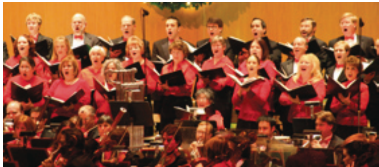
The Buffalo Philharmonic Chorus will perform several holiday concerts in the coming weeks.

The Buffalo Philharmonic Orchestra is celebrating the joy and magic of the holidays in concert.