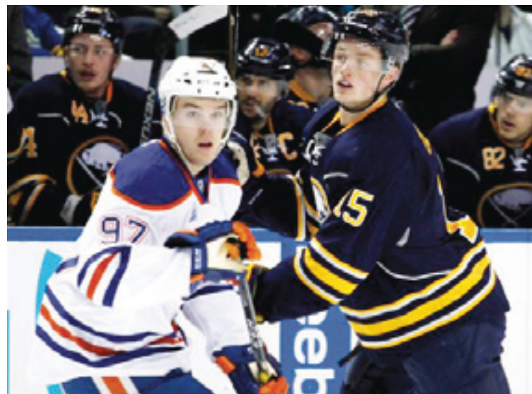
Edmonton Oilers Center Connor McDavid (left) and Buffalo Sabres Center Jack Eichel (right)

December 6th. While some in Buffalo hype this event, the reality is that as the NHL's leading scorer, McDavid has ascended to the top where he is quickly supplanting Sydney Crosby as the best player in the game. When he goes to Toronto the hype is McDavid vs. Auston Matthews. In Winnipeg it's the McDavid - Patrick Lainie (rookie sensation with NHL second best 16 goals) hype.