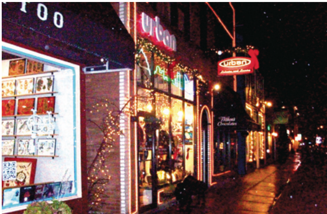
Many merchants along Elmwood Avenue will have extended hours and serve refreshments every Friday until Christmas during the Sip 'n' Shop event.

Come out and celebrate the Holiday Season in the Elmwood Village as many boutiques have extended hours and will be hosting a Sip 'n' Shop this and every Friday leading