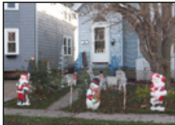
1. 16 Avery Ave.

or email to editor.buffalorocket@gmail.com