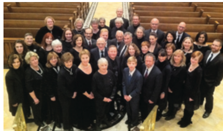
The Choir of St. Louis Church will present the service of Lessons and Carols on Sunday, December 18th. All are invited and welcome to attend.

The Choir of St. Louis Church is an all-volunteer ensemble composed of members of the parish and other area music lovers. The choir rehearses each Thursday evening and leads the musical worship at 11:00 am each Sunday. Its repertoire covers nine centuries of sacred music and nearly every style of western composition. In recent years, members of the choir have performed with the Buffalo Philharmonic Orchestra, Ars Nova Chamber Musicians, Camerata di Sant' Antonio and Greater Buffalo Opera Company.