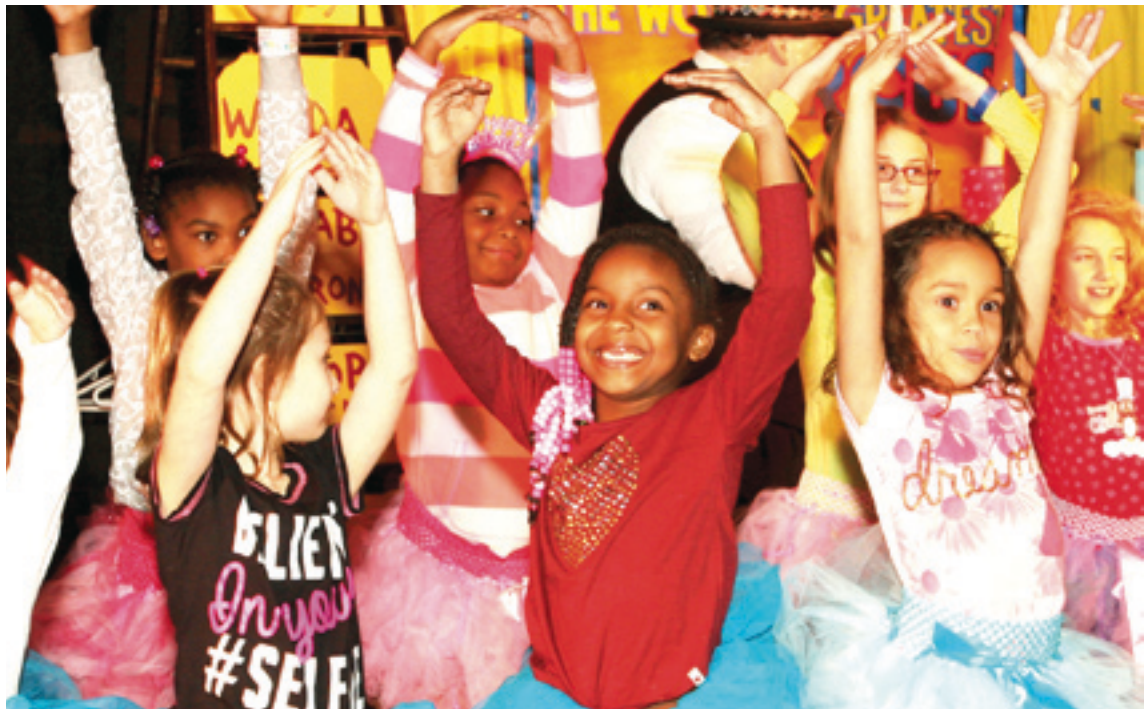
First Night Buffalo is the mainstay event in our community for fun, safe and healthy activities for the entire family to ring in the new year.

Join the Independent Health Foundation as they present First Night Buffalo®, the ultimate drug- and alcohol-free New Year’s Eve celebration. The event will be held from 5 pm to 10 pm, Saturday, December 31st,