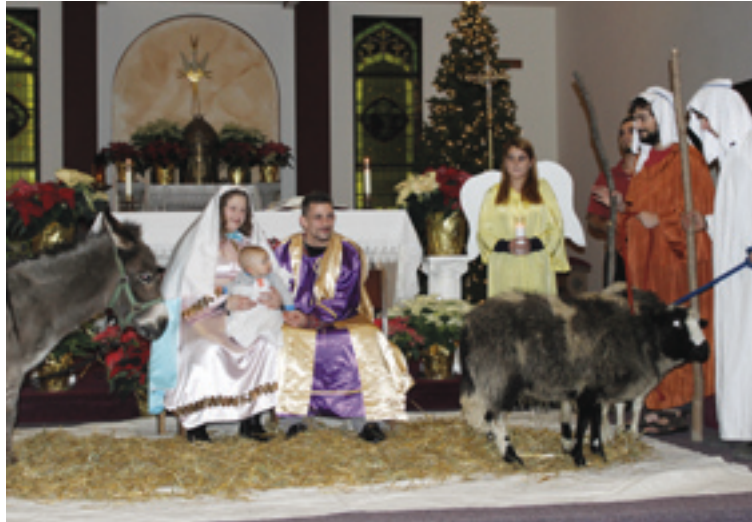
Holy Spirit once again will host a Living Nativity on Christmas Eve.

Holy Spirit, 91 Dakota St., will have Christmas Eve mass at 4 pm and 11 pm with Nativity procession preceded by sacred music choral at 10:30 pm. Christmas Day there will be an 11 am Children’s mass.