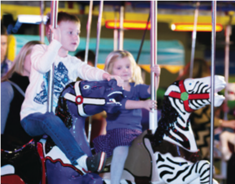
Children can enjoy numerous activities and entertainment during First Night Buffalo in a safe and family-friendly environment on New Year's Eve.

For more information and a complete schedule of events, visit the First Night Buffalo website at www.firstnightbuffalo.org , or call 635-4959.