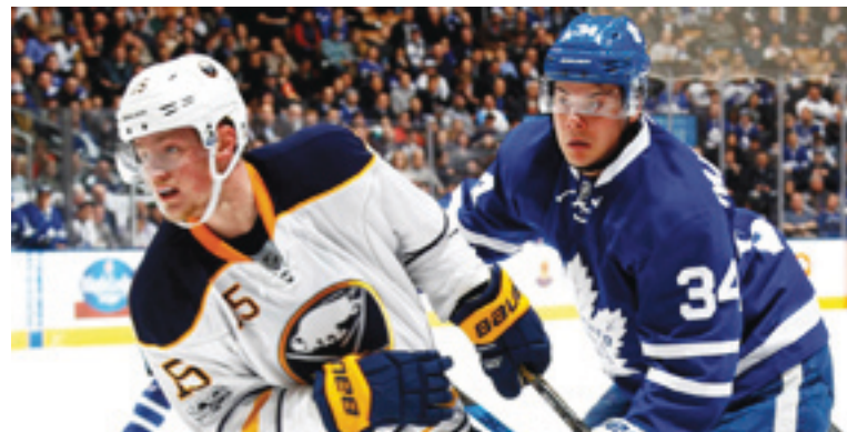
Jack Eichel (left) and Auston Matthews (right)

Obviously the Leafs were coached to take advantage of Buffalo's vulnerable goaltenders. The loss drops Buffalo's record this month to 4-3- 1 and 43 points which is nowhere near good enough to make up ground against Toronto and Ottawa who are tied with 50 points in the last playoff spot both with two games in hand over Buffalo. The Sabres are last in the Atlantic Division and one point ahead of the woe-ful Islanders at the bottom of the Eastern Conference.