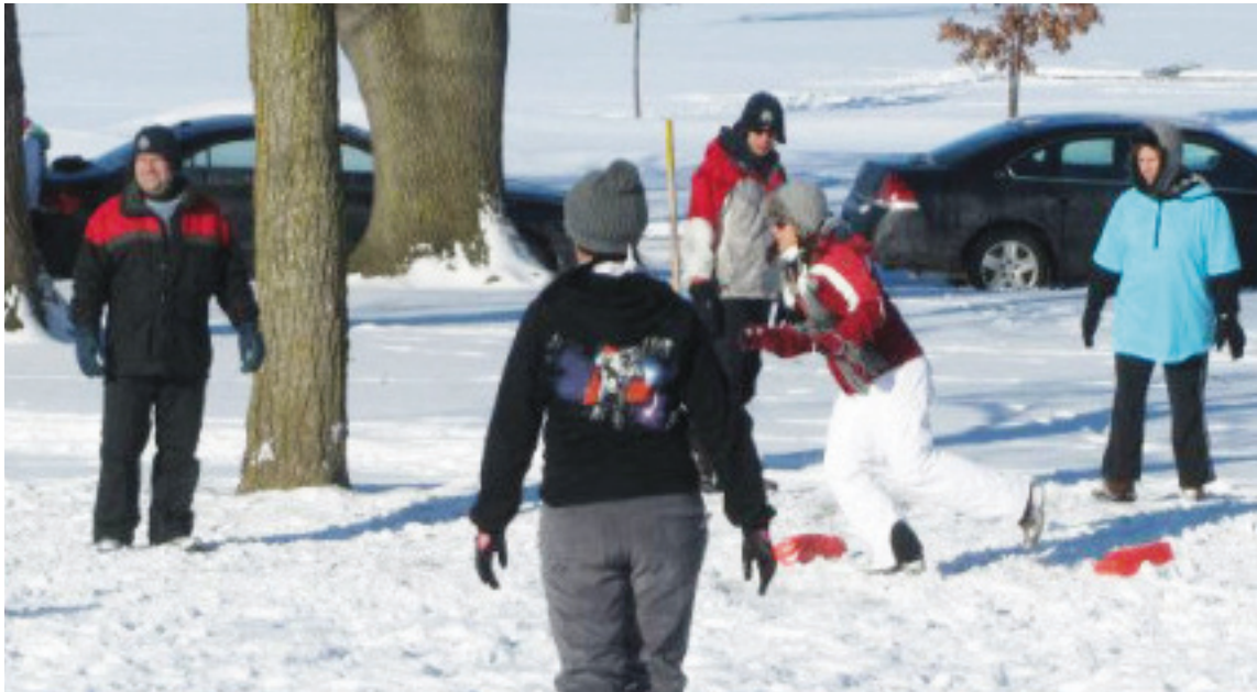
Snow or no snow, outdoor kickball players will gather in Delaware Park to play games to benefit the Buffalo Olmsted Parks Conservancy.

Outdoor Snow Kickball Tournament to benefit Buffalo Olmsted Parks Conservancy will take place in Delaware Park (near Parkside Lodge), on Saturday, January 28th. Check-in be-