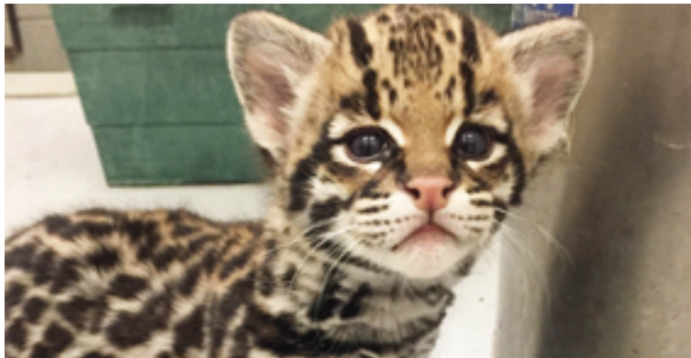
The new ocelot kitten's name will be announced during his public debut at the zoo this Sunday.

Patrons are reminded that admission is just $5 in January and February.