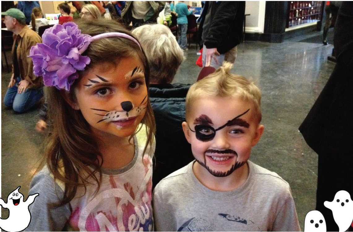
Popular annual family fun for “boos and ghouls” of all ages!

On Saturday, October 28, The Buffalo History Museum is throwing a community friendly All Hallows Eve Party from 10 am to 1 am. Museum members and children under 7 get in free, adult admission is $7.00, seniors and students over