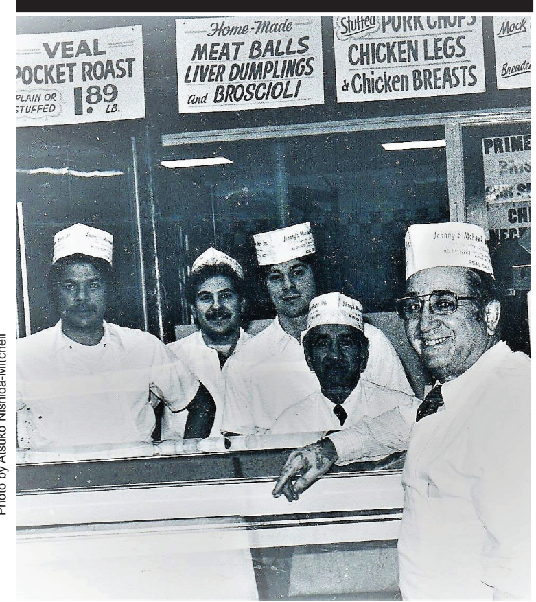
Johnny's Meats early 90's. See if you can get their names.