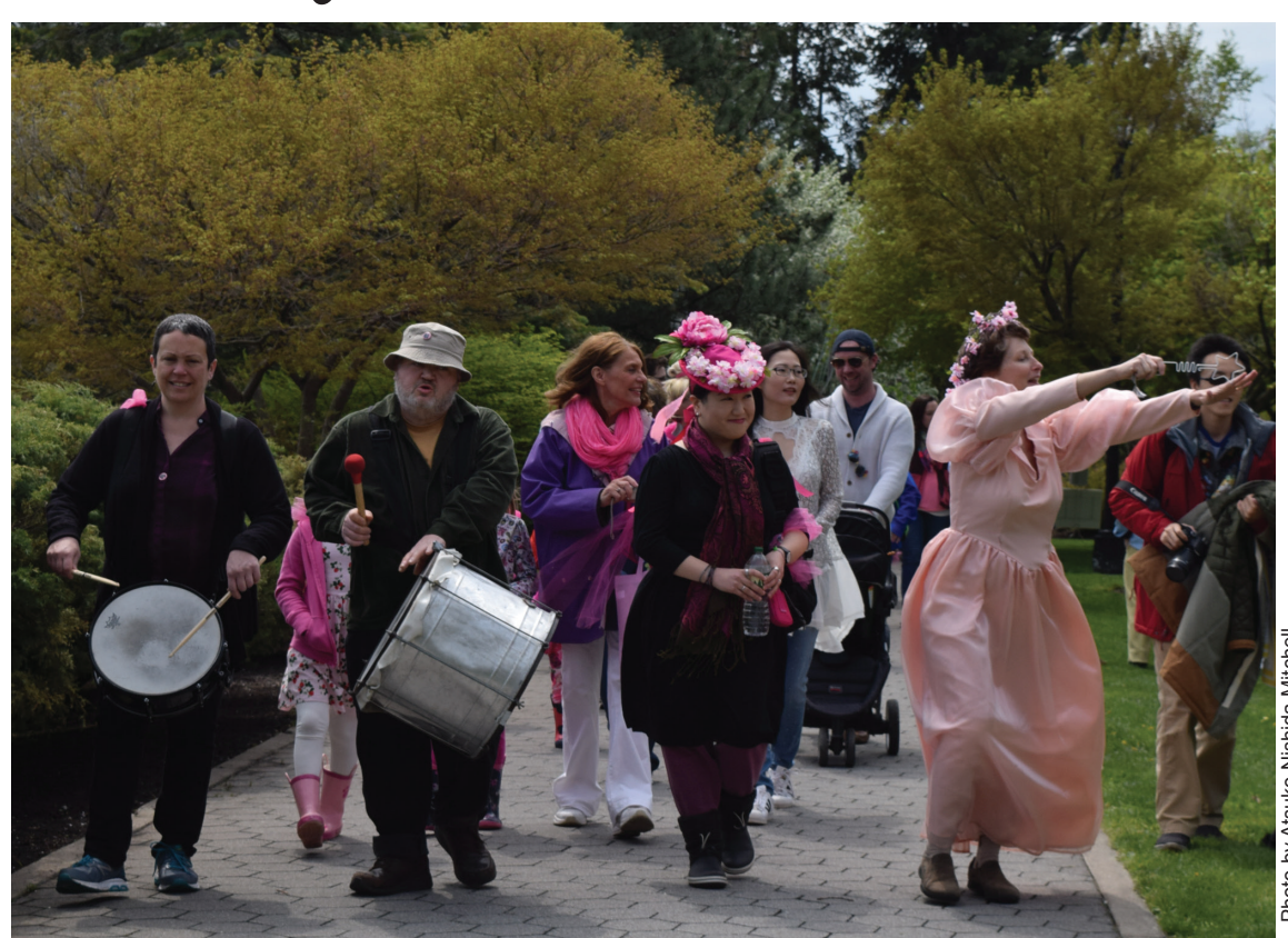
The Cherry Blossom Princess leads the Pink parade, one of many celebrations that take place during the festival.

The 5th Annual Cherry Blossom Festival features a week of activities at the Japanese Garden in Delaware Park. The festival runs from Wednesday, May 2nd - Sunday, May 6th.