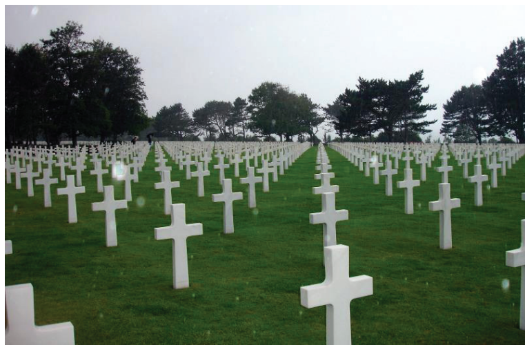
Amercian Cemetery at Normandy

Memorial Day is not meant to just honor our fallen heroes but also the memories of our loved ones who have also left this life. My mother and Dad died over 50 years ago but still there is not a day that goes by that a memory of them pops into my head. My Dad would have loved this, my mom would have enjoyed this food, and I still use some of my late brother's jokes. They live on and on in our memories. They will until we join them in whatever comes next. All we can hope for is that we leave enough good memories to have made our existence worthwhile.