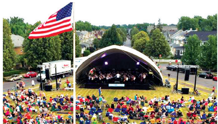
North Park Academy will host the Buffalo Philharmonic Orchestra for the second annual free concert on the lawn.

bring the Buffalo Philharmonic Orchestra to North Buffalo residents as part of their free summer season concerts.