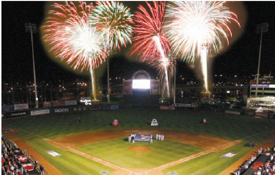
Independence Eve Celebration continues the tradition with Buffalo Bisons baseball, music by the BPO and a grand fireworks finale.

The great Western New York summer tradition! On Tuesday, July 3rd, join us for the 24th Annual KeyBank Independence Eve Celebration with the Buffalo Philharmonic Orchestra and Chorus and the largest fireworks show