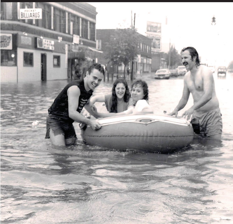
North Buffalo residents prove to be resourceful in 1986 during flooding on the corner of Hertel and Virgil Avenue.