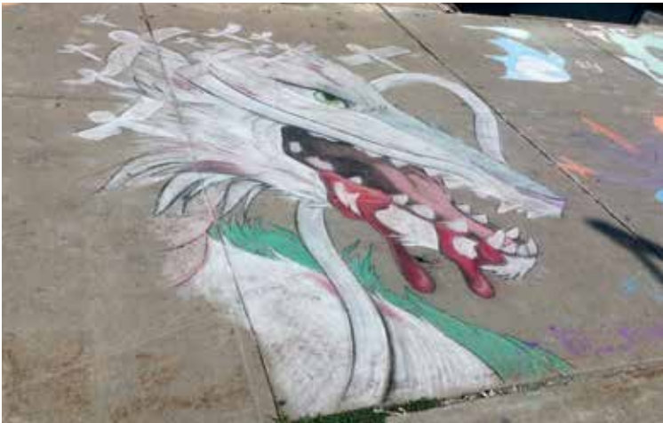
Buffalo’s Annual Miyazaki Chalk Contest celebrated its fifth year as one of the coolest expressions of Studio Ghibli love on the planet last weekend. The top 3 prize packages were sponsored by GK-IDS Films and include a complete set of all 9 Hayao Miyazaki Blu-Rays, plushies and internet fame. The festival was hosted by North Park Theatre on Hertel Ave.