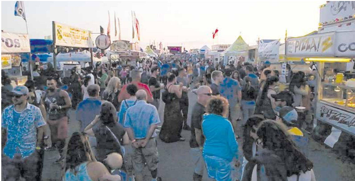
Benvenuti amici. Welcome friends to the new and improved Galbani Italian Heritage Festival’s new home at the Outer Harbor.

When the Galbani Italian Heritage Festival moved from the Hertel Avenue location after 29 years, there was a mixed reaction. Some eagerly accepted the change, some people were sad about the change, rumors circulated about why it moved. But the real reason why the festival moved to the larger space was in order to enlarge the festival. The festival organizers realize some people didn’t embrace this change, but this year it will become more evident as to why the move and the changes are happening. This year’s Italian Festival has so many new and exciting features that you will enjoy. The newly designed