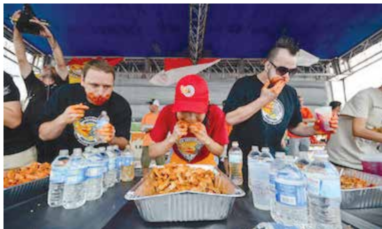
One of the annual highlights of the festival weekend is the United States Chicken Wing Eating Championship.

The festival benefits Alzheimer's Association Western New York Chapter, Food Bank of WNY and Meals on Wheels for Western New York Inc. The festival has raised more than $365,000 since its inception in 2002. For more information visit www.buffalowing.com