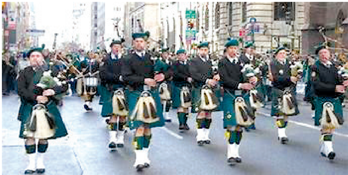
The annual parade welcomes people and families of all ages to Delaware Avenue. The parade will begin at 2pm at City Hall.

The 2019 Saint Patrick's Day Parade will be held this Sunday, March 17, 2019 on Delaware Avenue at 2:00 P.M. The parade is a great family friendly, religious, patriotic, and civic event in Buffalo that honors Saint Patrick and displays the Irish contributions to our community and country. The United Irish