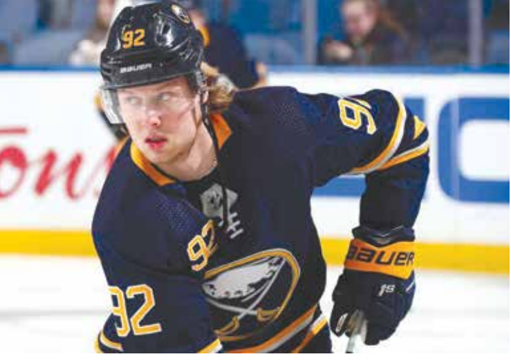
Nylander looks like an NHL player.

can continue to produce offensively then the Sabres could afford to put