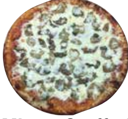
Mister Stuffed Hot Pepper

ALL PIZZAS COME ON OUR FAMOUS 12" BRICK OVEN DOUGH • ALL PIZZAS CUT IN 6 SQUARES