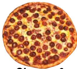
Cheese & Pepperoni