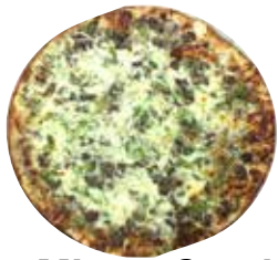
Mister Steak Pizza