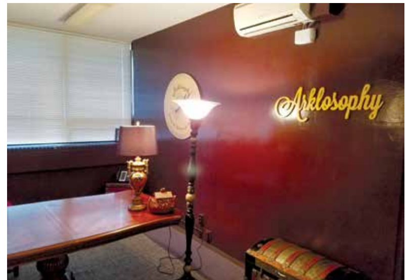
One of the renovated office - conference rooms at the North Buffalo Community Center.

FREE PIZZA: E. Defabio-Harvey, 54 Eugene Ave., 14216