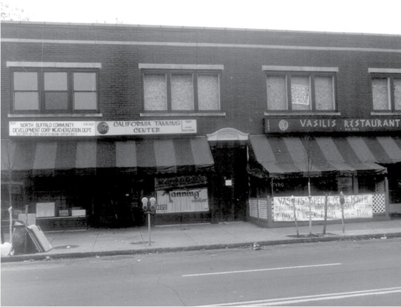
Original store front location on the corner of Hertel and Fairchild for the North Buffalo Community Development Corp.

My hope is that they do the right thing. People are living longer, and it seems that more and more senior citizens apartments are needed and going up in record numbers. Is this one needed enough to take away what is at this point in time a well-run community center. As I read it, this will be the demise of the NBCDC as we know it. Even though there is promise of a center in the new building, the time needed to construct a new facility is too long for our present