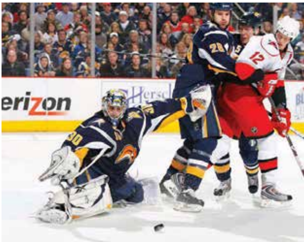
Erik Staal battles against Paul Gaustad and Ryan Miller

points in 909 games with the Hurricanes, he was traded to the Wild. Stall scored 28 goals in 2006-07 for Minnesota and surprised those who thought he was on the downward slide in his career by scoring 42 goals the next season. In four seasons with