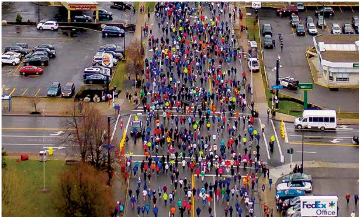
Runners cross the intersection of Hertel and Delaware Avenues during last year's Turkey Trot.

Since 1896 runners have competed in the cross-country race that has become today's Turkey Trot. The race is an 8k footrace which traditionally begins on Delaware Avenue, and continues into downtown Buffalo.