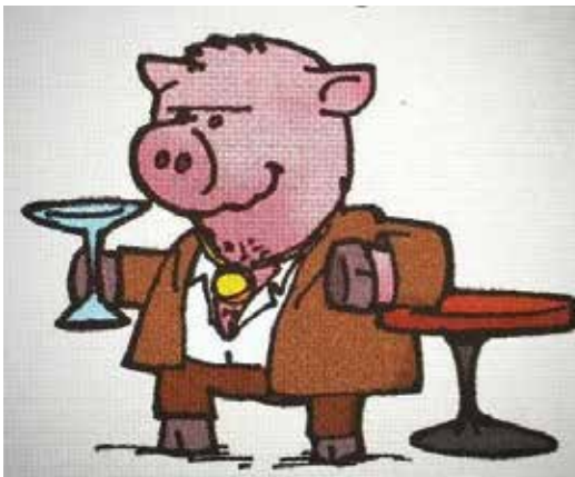
Cartoon representation of a MCP.

and the vast knowledge they possess. You have to remember I lived way back