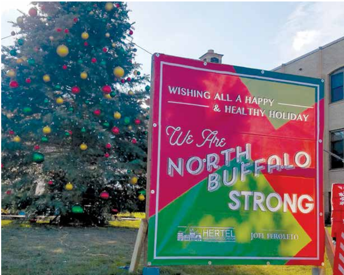
North Buffalo gets into the holiday spirit with the Christmas tree lighting last Friday on Hertel Avenue.