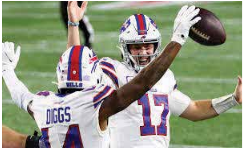
Stefon Diggs Josh Allen Buffalo Bills.

The Bills are the only team to outgain opponents by 250 yards in back to back road games (Broncos and Patriots) since 1961.