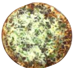
Mister Steak Pizza