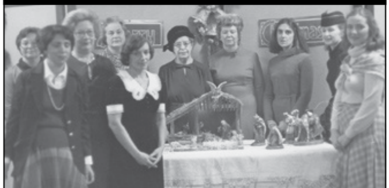
Holy Angels Academy, circa 1979, Christmas.