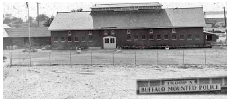
Mounted Police Stable on Porter Avenue. Posted by Joe Sparacio on the "I'm a product of the West Side of Buffalo" Facebook page.

There were other things that Front Park used to offer. Centennial Public Pool, gigantic swimming facility for all to enjoy. The American side entrance of the Peace Bridge ended at the park. A road went under it and progressed into the park. On this road just before you go under the bridge was a little hot dog stand. Teds. Alongside this road on top of the embankment was a sidewalk with