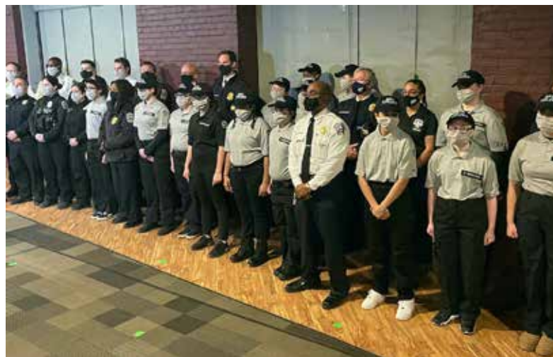
Buffalo Police community attending ceremony.

viding opportunities that promote leadership, confidence, self-discipline, and community service while developing an awareness of its purpose and objectives of law enforcement and the Buffalo Police Department. Learn more at buffalopoliceexplorers.com .