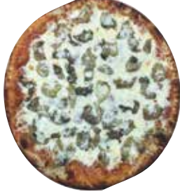
Mister Stuffed Hot Pepper