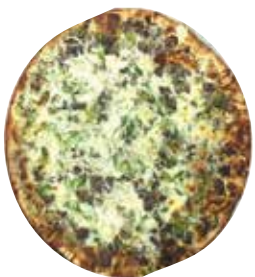
Mister Steak Pizza