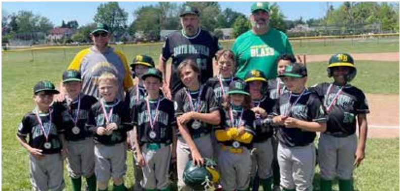
North Buffalo Baseball team.

Memorial Day is getting to be one of the best holidays of the year for North Buffalo Baseball. It's the time when the Hertel North Park League holds its Annual Jimmy Collins Memorial Baseball Classic Tournament. This year's competition almost couldn't happen because of a soaking rainfall on its first day. But the three day event May 28th-30th, was a huge success for 26 area youth baseball teams, all coming into Shoshone Park, for some great games.