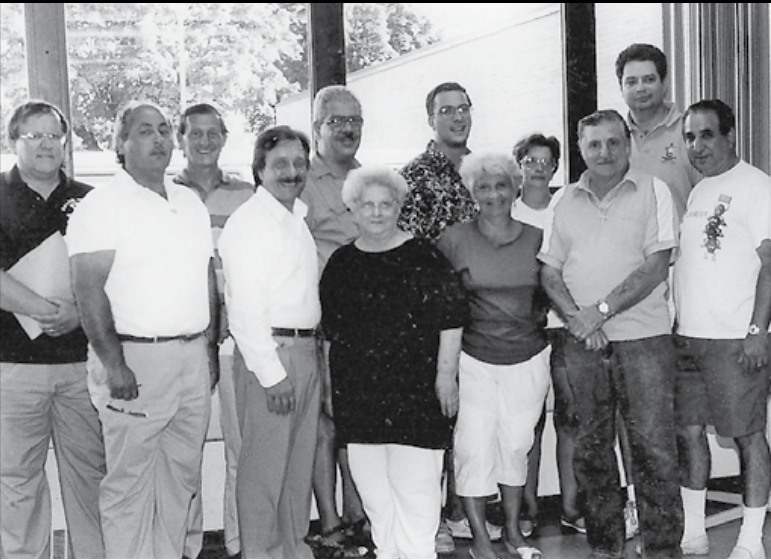
The Buffalo Italian Festival Committee of 1993.