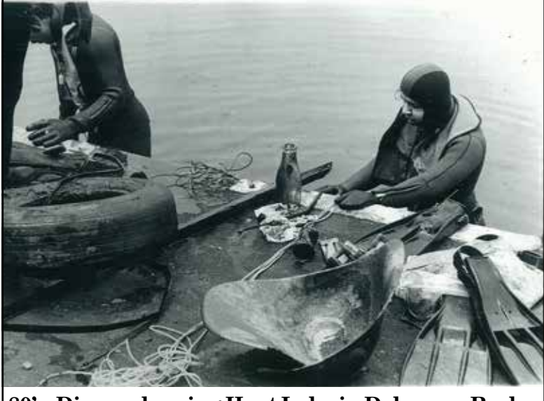
80's. Divers cleaning Hoyt Lake in Delaware Park.