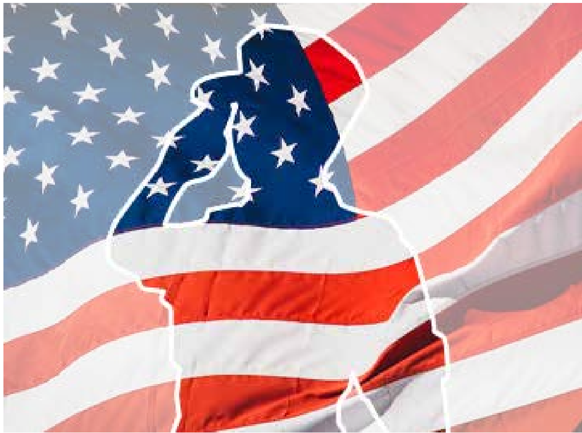
Veterans Day will be celebrated this year on November 11, 2021.

Veterans Day, observed annually on November 11, is a tribute to military veterans who have served in the U.S. Armed Forces. Not to be confused with Memorial Day, which honors those who died while in service, Veterans Day honors all military veterans, including those still with us. Veterans Day is observed