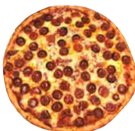
Cheese & Pepperoni