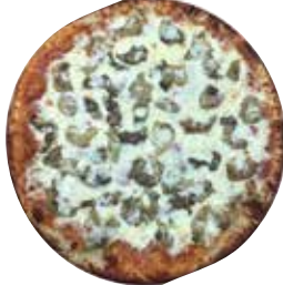
Mister Stuffed Hot Pepper