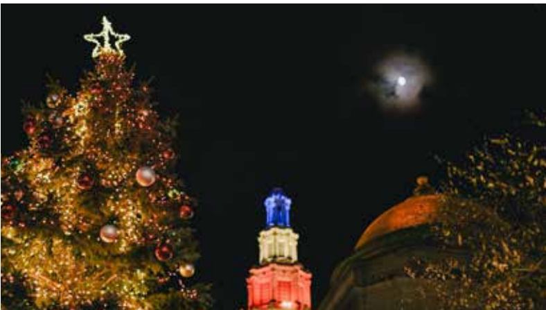
Look of downtown Christmas City Hall in Buffalo.

Farm in Hamburg will be on-site and visiting with guests. Downtown restaurant, The Lunch Box, will offer concession items in the event area. Ice-skating is free and ice-skate rental is available; $2 for children and $3 for adults. Guests are encouraged to bring their own ice-skates and avoid waiting in the ice-skate rental line. Santa will visit with children from 6:30pm to 8pm.