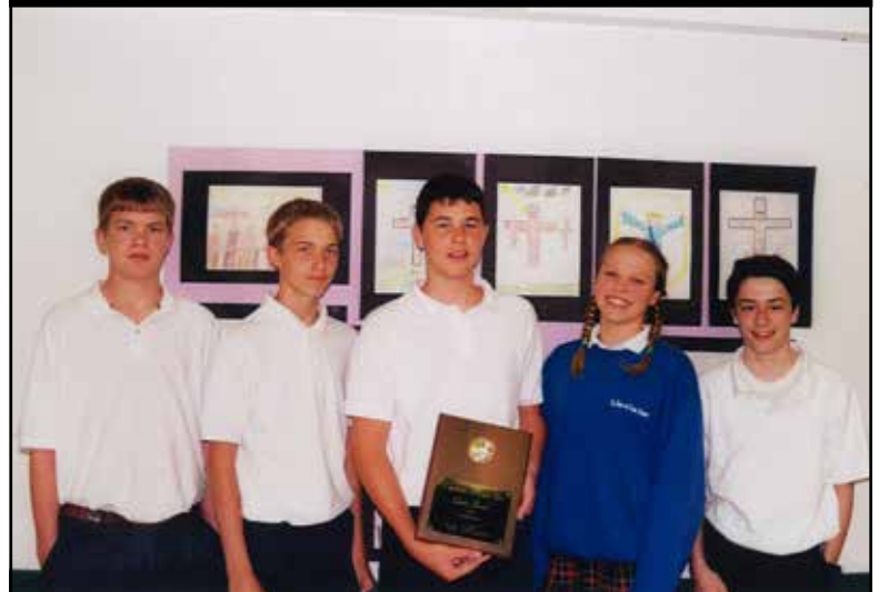
Circa 2003. The St. Rose of Lima Quiz Kids competition, 1st Place winners of the Cardinal O'Hara Quiz Bowl.