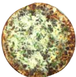
Mister Steak Pizza