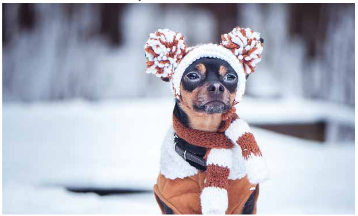
Pet owners should be aware of the winter's effects for their pet's safety.

With the colder temperatures coming as winter approaches, we have been preparing ourselves and our families for the change of seasons. This may come in the form of changing out the closets to the warmer clothes, getting out the heavier jackets and getting the boots ready at the front door.