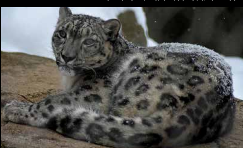
January 15, 2018. Altai, a one-year-old male snow leopard, comes to the Buffalo Zoo from the Akron Zoo.