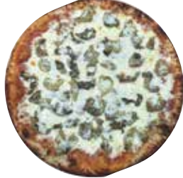
Mister Stuffed Hot Pepper