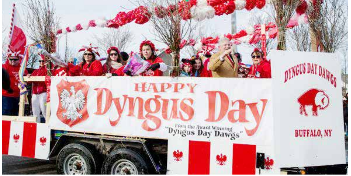
The Annual Buffalo Dyngus Day Parade arrives April 18th, set to travel throughout the historic Polonia District.

Get your squirt guns and pussy willows ready. Buffalo's Dyngus Day parade is back for 2022.