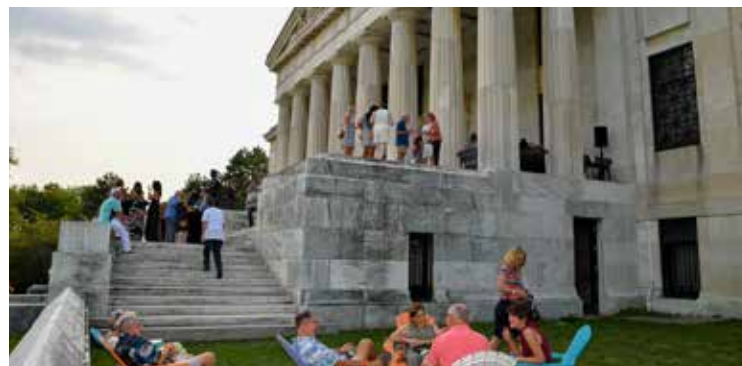
The annual "Party on the Portico", 2021, Buffalo History Museum.

Party on the Portico is a 21 and over event and runs rain or shine. Tickets are $20 for the public, ($10 for members) and can be purchased online at https://buffalohistory.org/event/door .