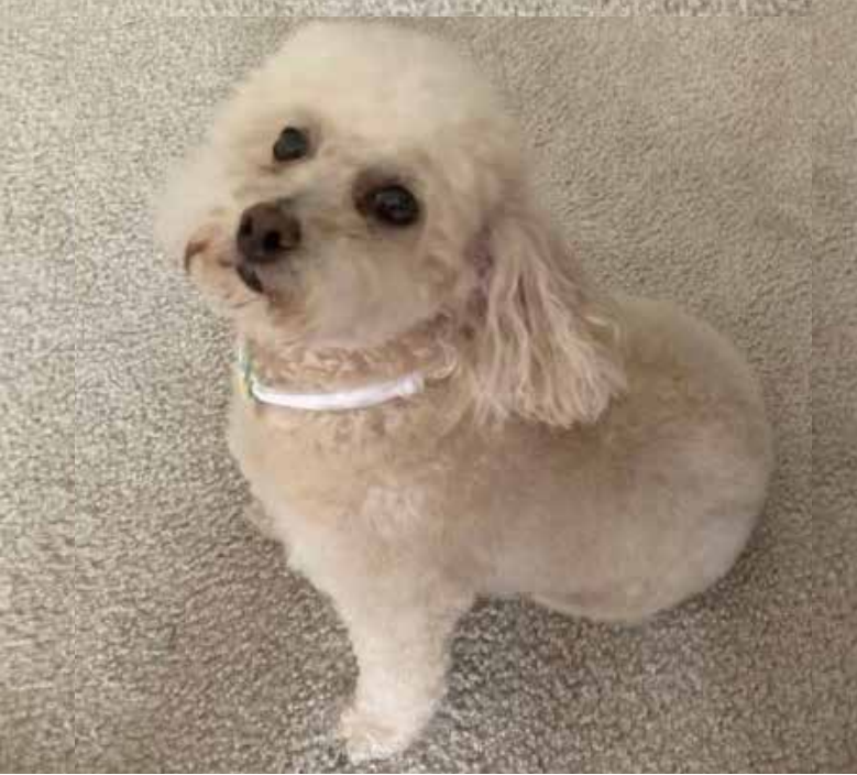
My wonderful Apricot Poodle, Angel.

As far back as I can remember we always had a dog and a cat. When I was a kid, seldom if ever did we put the dog on a leash or the cat in a cage. They were free to roam as they pleased and